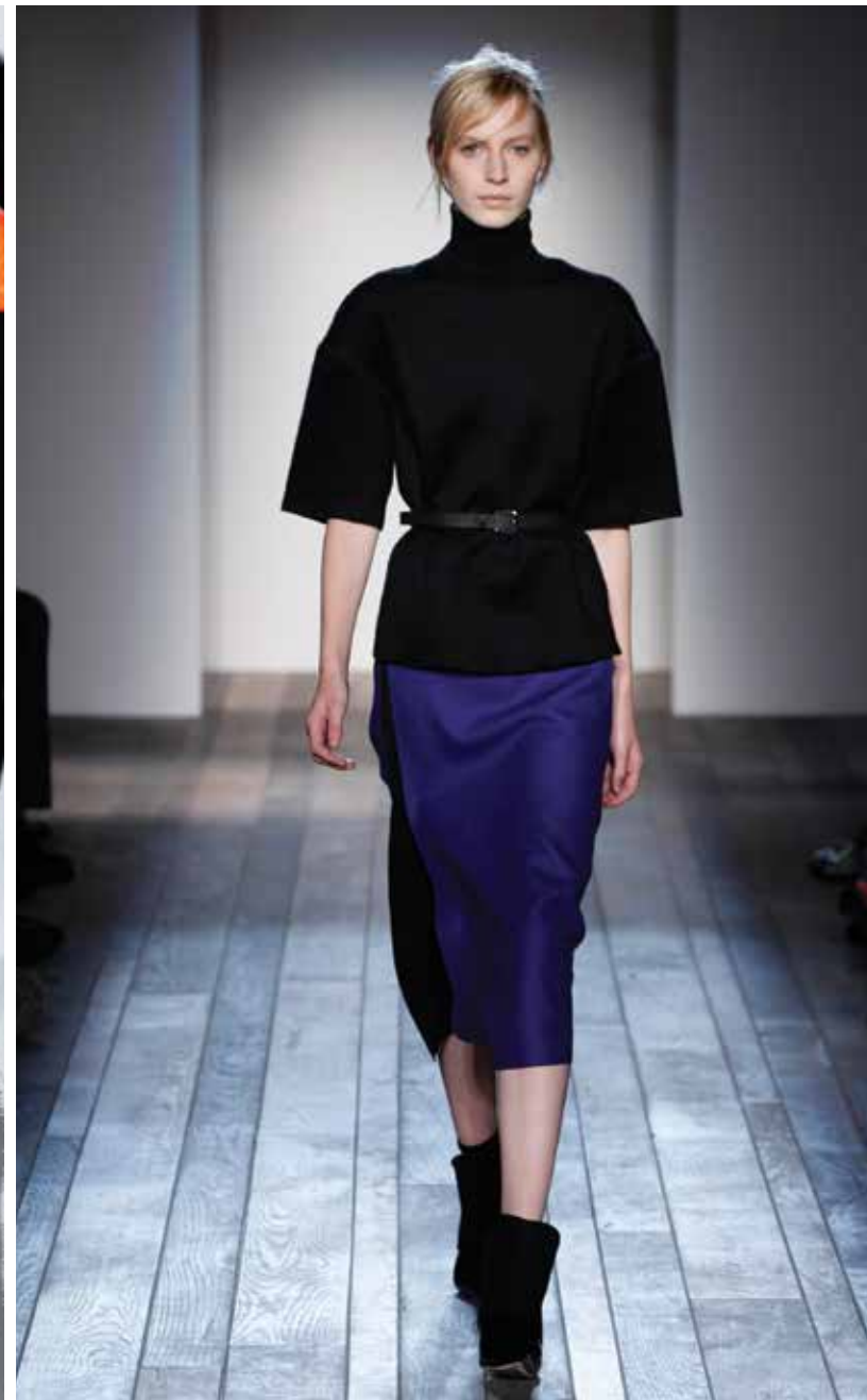
Victoria Beckham Double cashmere soft T-shirt, $2,850; wool felt wrap-tie skirt, $1,395; sold at net-a-porter.com ; suede patent Cruz booties by Manolo Blahnik for Victoria Beckham, $1,084, manoloblahnik.com . Belt not available for purchase.