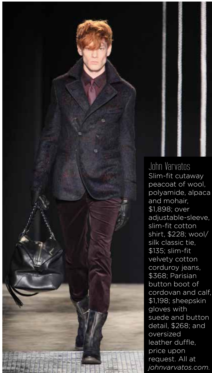
John Varvatos Slim-fit cutaway peacoat of wool, polyamide, alpaca and mohair, $1,898; over adjustable-sleeve, slim-fit cotton shirt, $228; wool/silk classic tie, $135; slim-fit velvety cotton corduroy jeans, $368; Parisian button boot of cordovan and calf, $1,198; sheepskin gloves with suede and button detail, $268; and oversized leather duffel, price upon request. All at johnvarvatos.com .