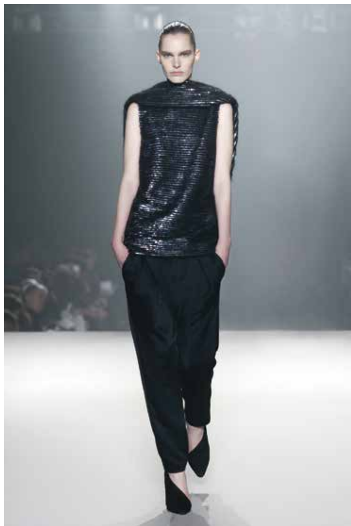
Alexander Wang French knot mohair embroidered mohair/polymide plunging-back top in asphalt with sequin details, price upon request; asymmetric draped jogging pant in asphalt viscose, $695; Marcella asymmetric black kid suede pump, $775; all at alexanderwang.com .