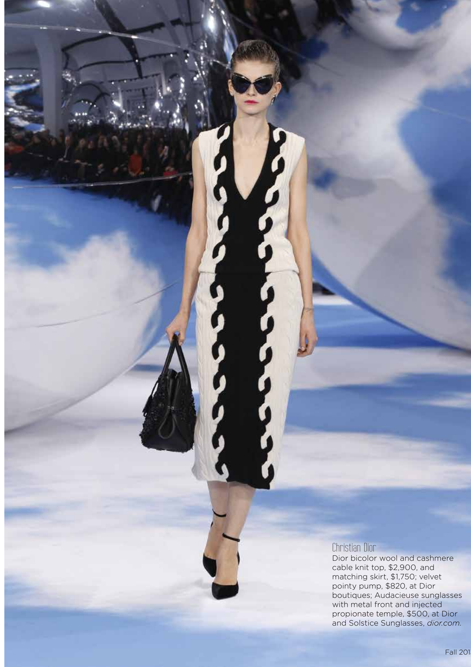
Christian Dior Dior bicolor wool and cashmere cable knit top, $2,900, and matching skirt, $1,750; velvet pointy pump, $820, at Dior boutiques; Audacieuse sunglasses with metal front and injected propionate temple, $500, at Dior and Solstice Sunglasses, dior.com .

Catwalks' latest catnip also serves as antidote to the anarchic (yet ironically pervasive) punk. And you can wear it to work, then don a cape for nighttime drama. ▷