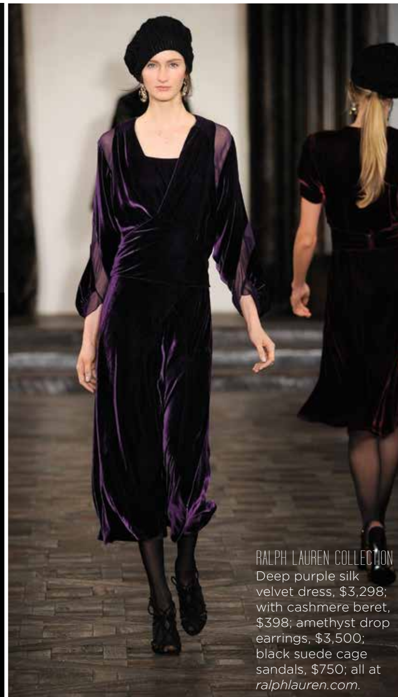
RALPH LAUREN COLLECTION Deep purple silk velvet dress, $3,298; with cashmere beret, $398; amethyst drop earrings, $3,500; black suede cage sandals, $750; all at ralphlauren.com .