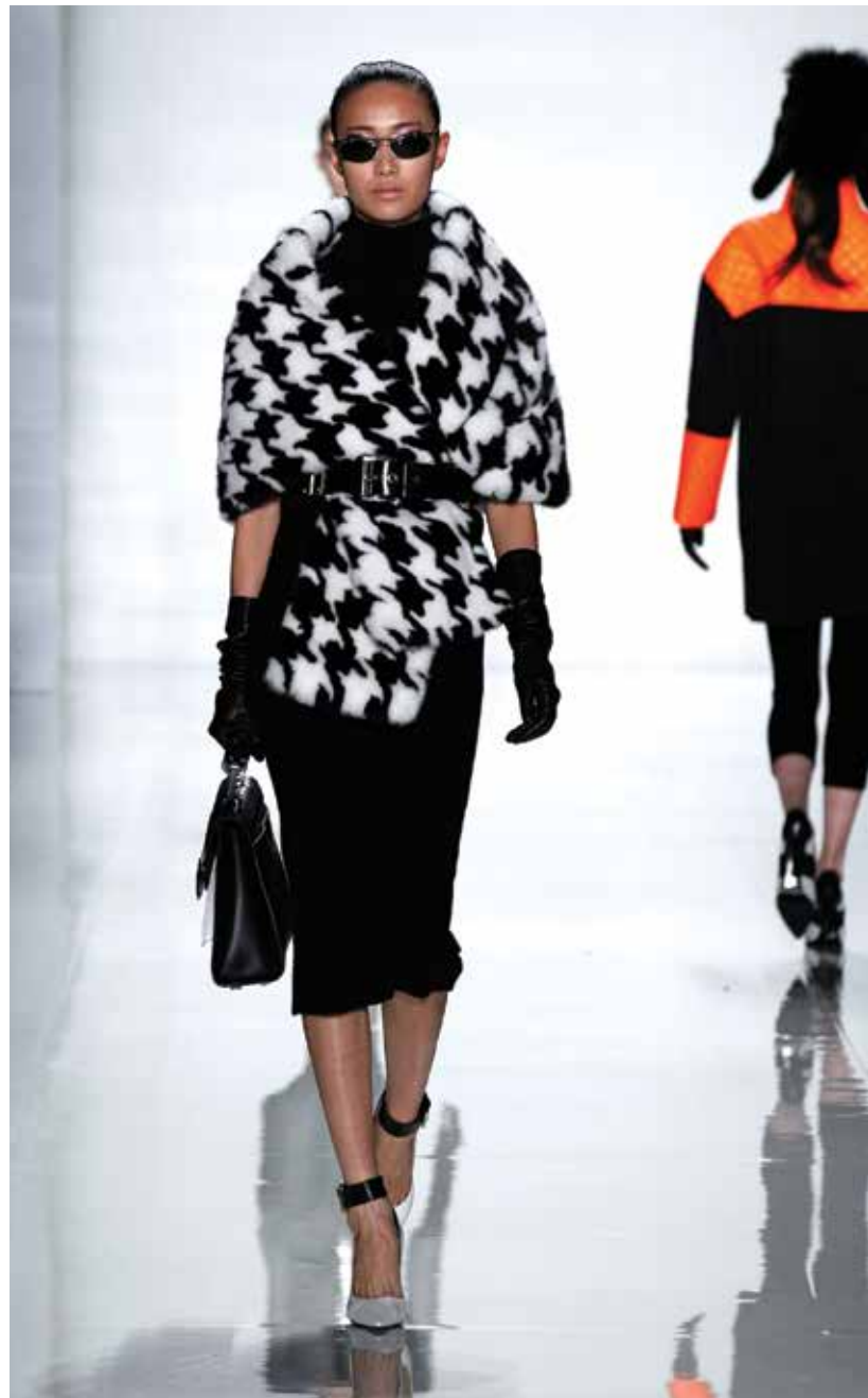
Michael Kors Dogtooth mink stole, $17,995; raglan short-sleeve mock turtleneck sweater of cashmere, $850; Shaker pencil skirt in cashmere, $1,150; with Ingrid silver-toned metal goggles, $195; Carrington top-handle leather satchel, $1,195; and Ayah leather runway heels, $695; available at select Michael Kors stores, michaelkors.com .