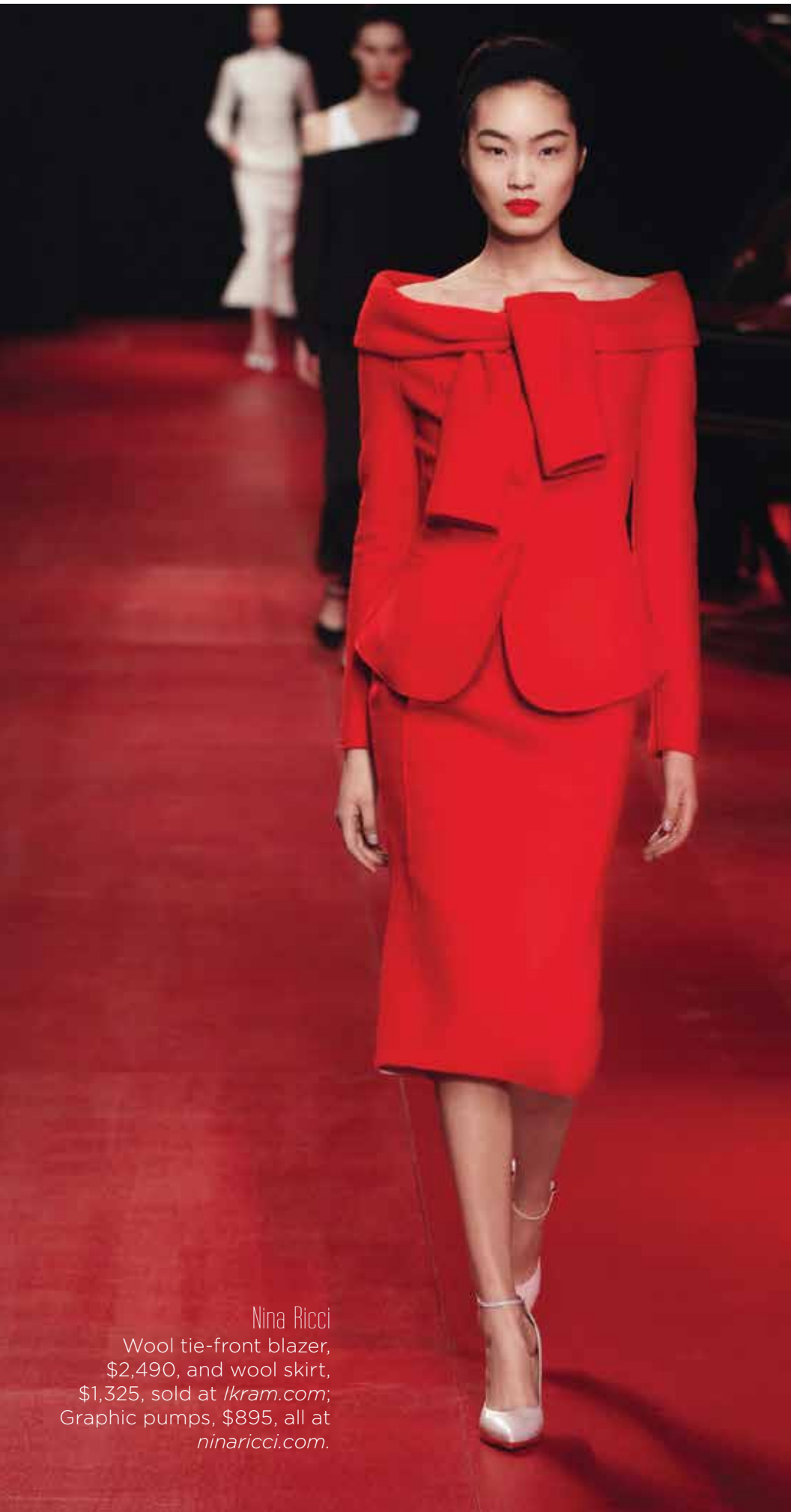
Nina Ricci Wool tie-front blazer, $2,490, and wool skirt, $1,325, sold at Ikram.com ; Graphic pumps, $895, all at ninaricci.com .