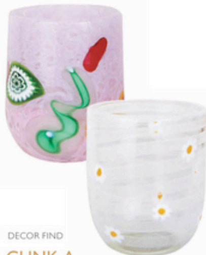
Laguna B's color-punched tumblers, $117 to $128 each

His Guinness World Records feat: Fifty years as the longest-running local TV news anchor at the same station in a major market Four-letter word he hates: "Calling TV news a 'show.' I always looked at it as a program of important information." Worst on-air gaffe: "Reporting a 72-hole golf tournament, I mispronounced hole as 'hotal'—you can't be on-air for decades and not