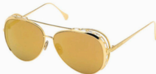
Sunglasses, $950, by Roberto Cavalli at Neiman Marcus, in the Galleria