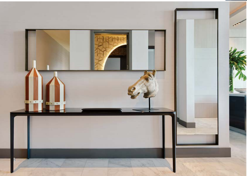
BELOW: Teran placed mirrors to hide a breaker box in the main foyer that otherwise “was an empty square,” he says.