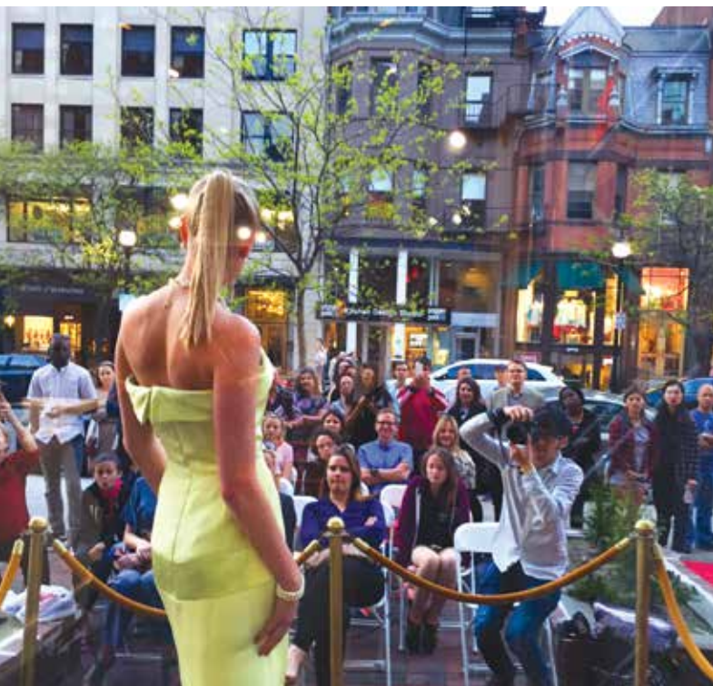
School of Fashion Design