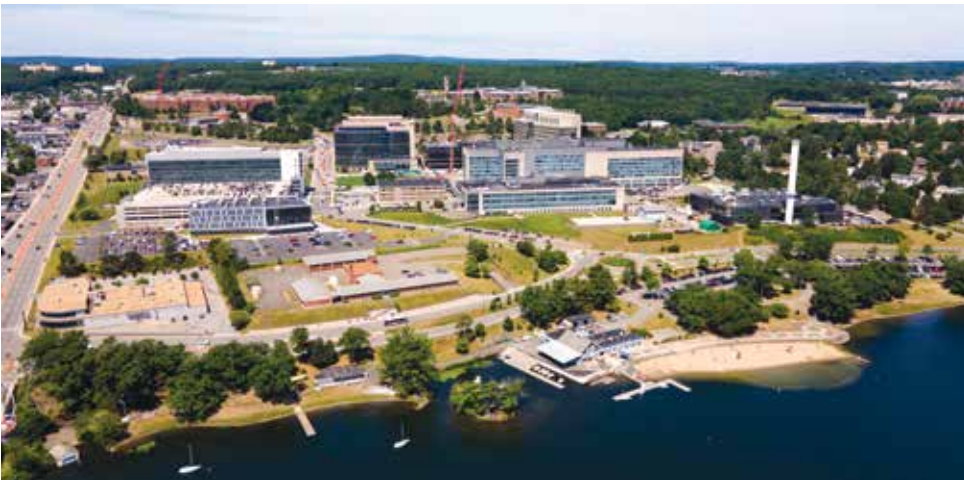
UMass Chan Medical School

The hybrid program, geared toward nurses who want to promote health and well-being through advanced leadership skills, offers classes on campus and online that equip practicing nurses with knowledge and skills to lead and effect change in clinical and non-clinical settings. Learners focus on building