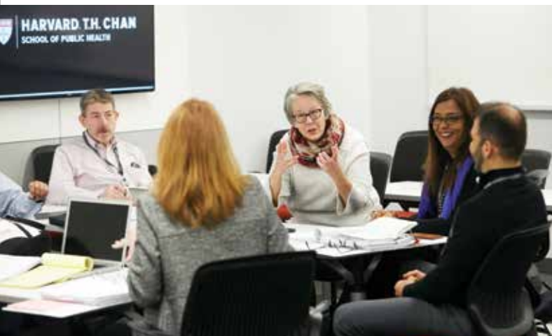
Harvard T.H. Chan School of Public Health