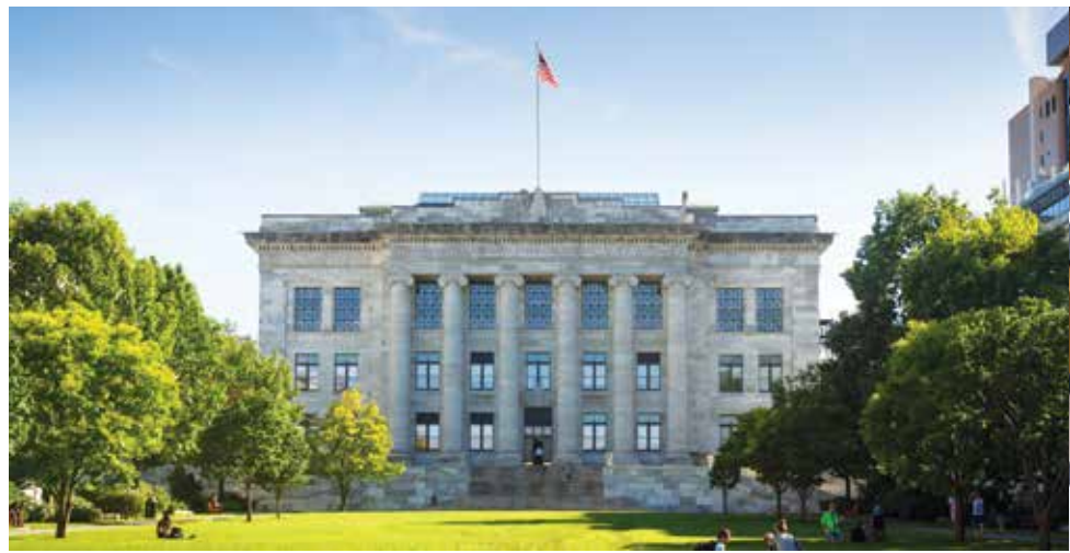
Harvard Medical School