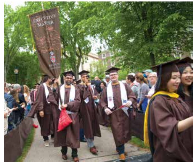
Brown University School of Professional Studies

Learn more at professional.brown.edu or by calling 401-863-7901.